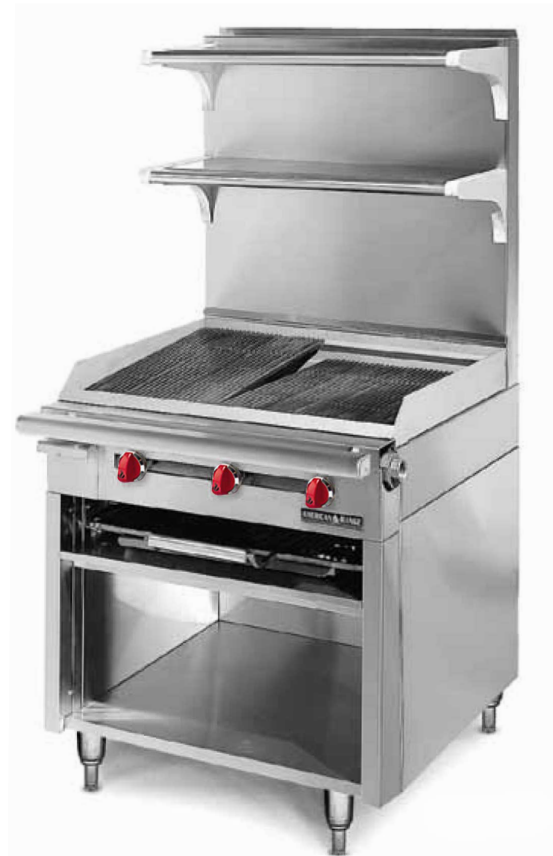
Model Shown HD34-CRB-0